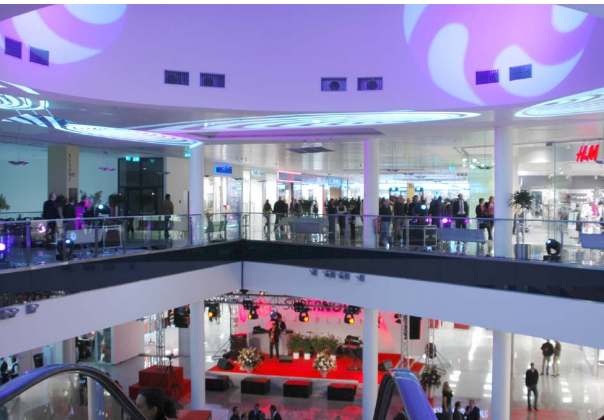
SC Supernova | Ljubljana