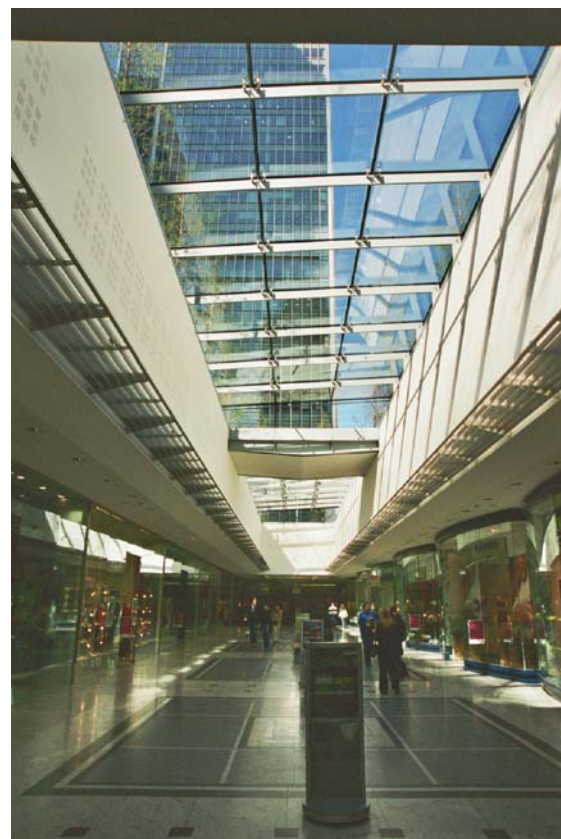
Canary Wharf Mall | London