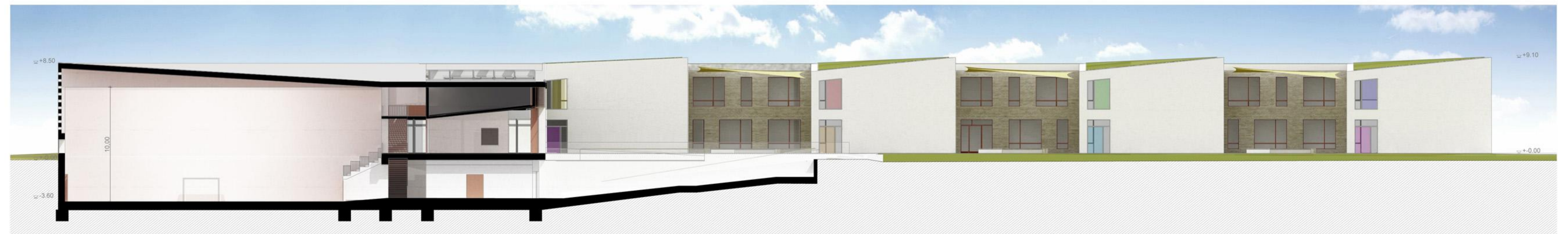
A-A metszet m1:200