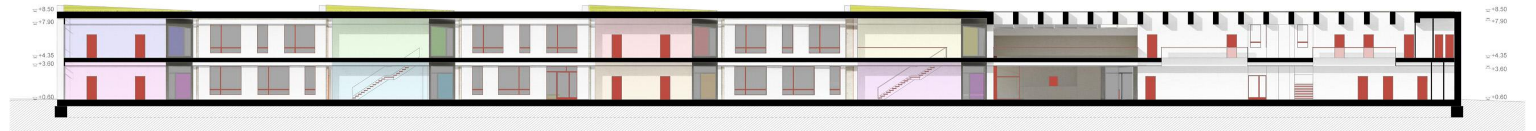
C-C metszet m1:200