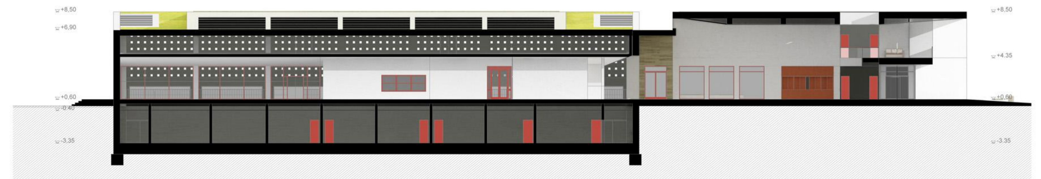
B-B metszet m1:200