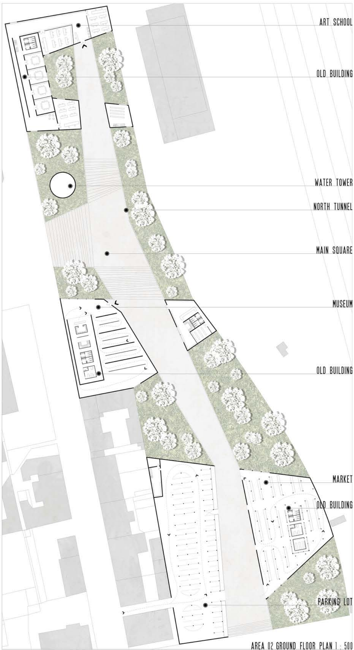
AREA 02 GROUND FLOOR PLAN 1 : 500