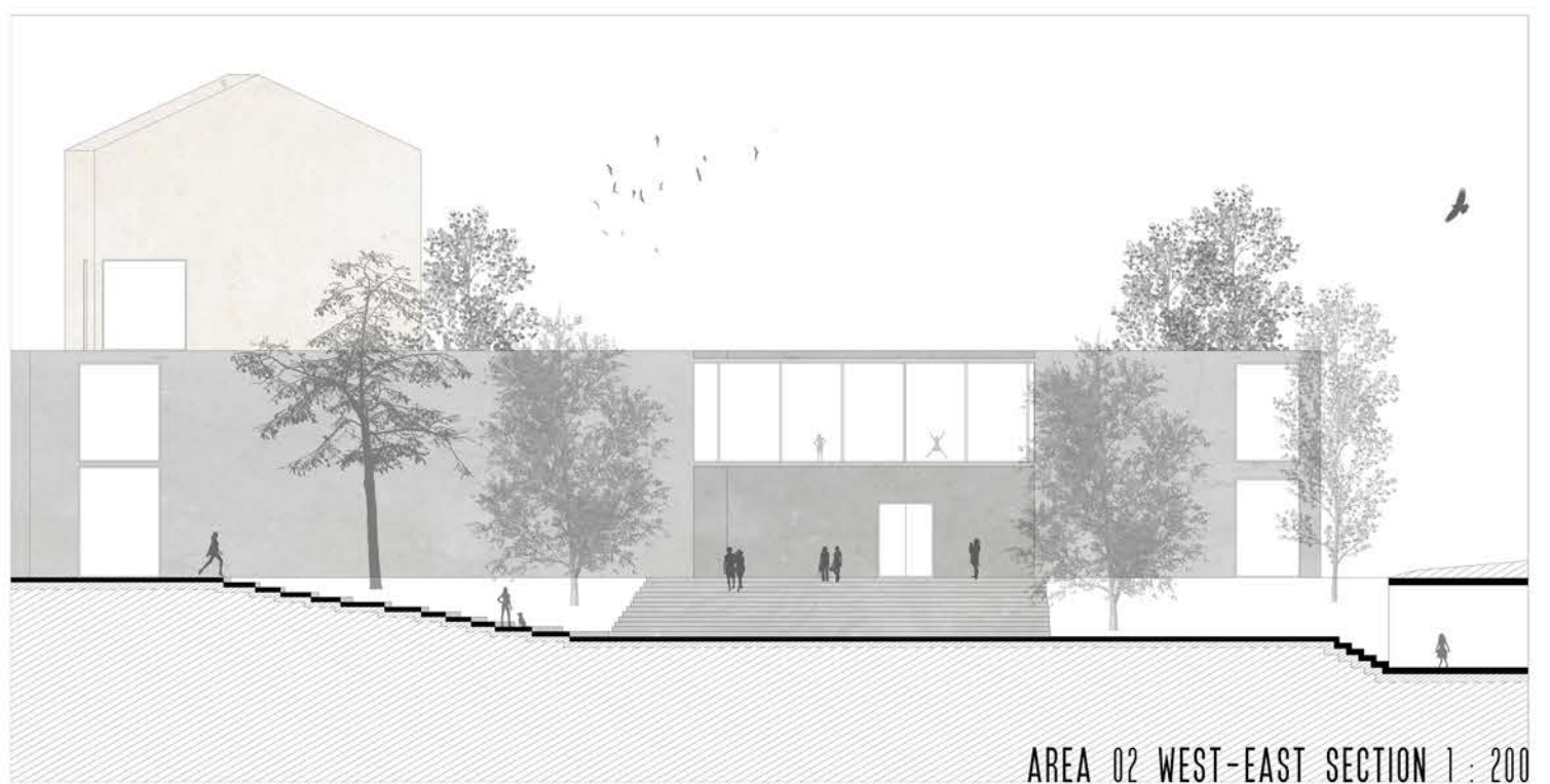
AREA 02 WEST-EAST SECTION 1 : 200