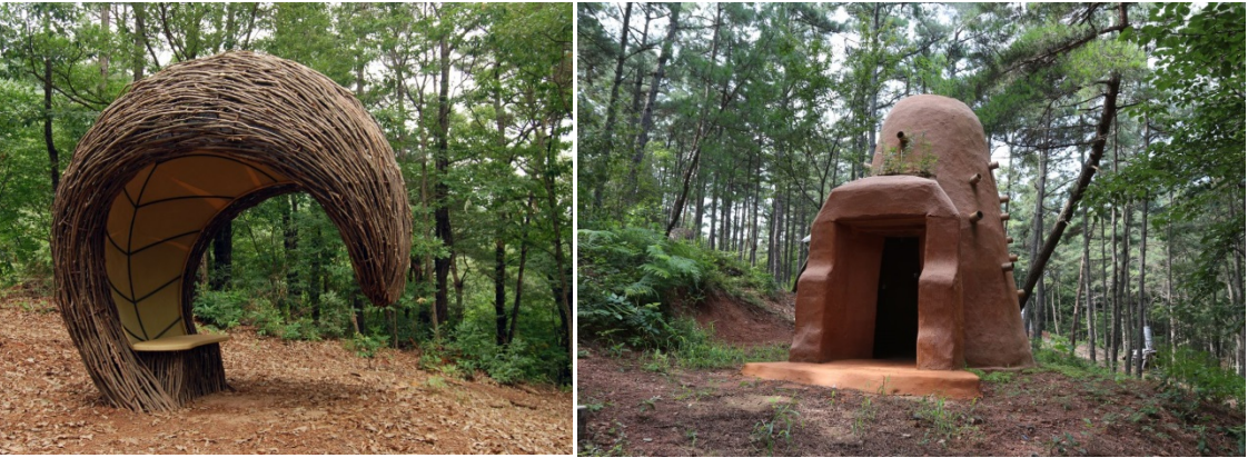
Tim Norris <Forest Wave Shelter>