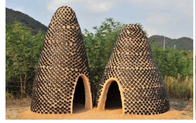
Manoir de Myriam <Contrasts and passages>