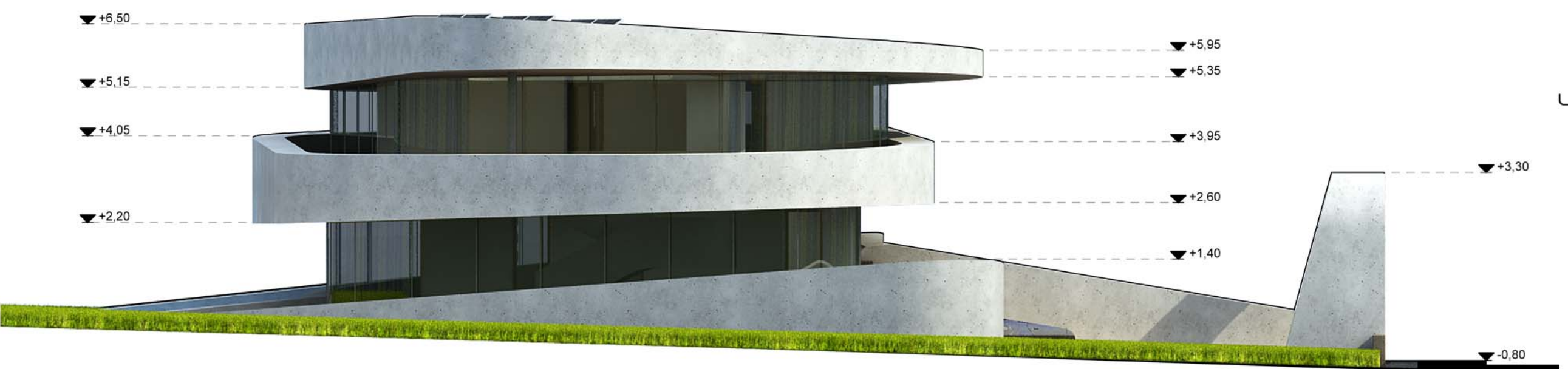
DÉL-KELETI HOMLOKZAT M=1:100