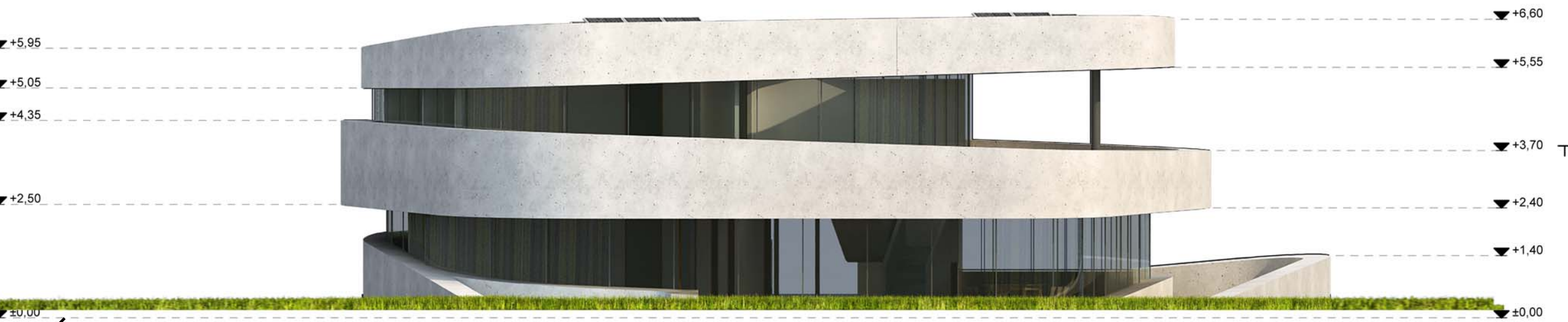
DÉL-NYUGATI HOMLOKZAT M=1:100